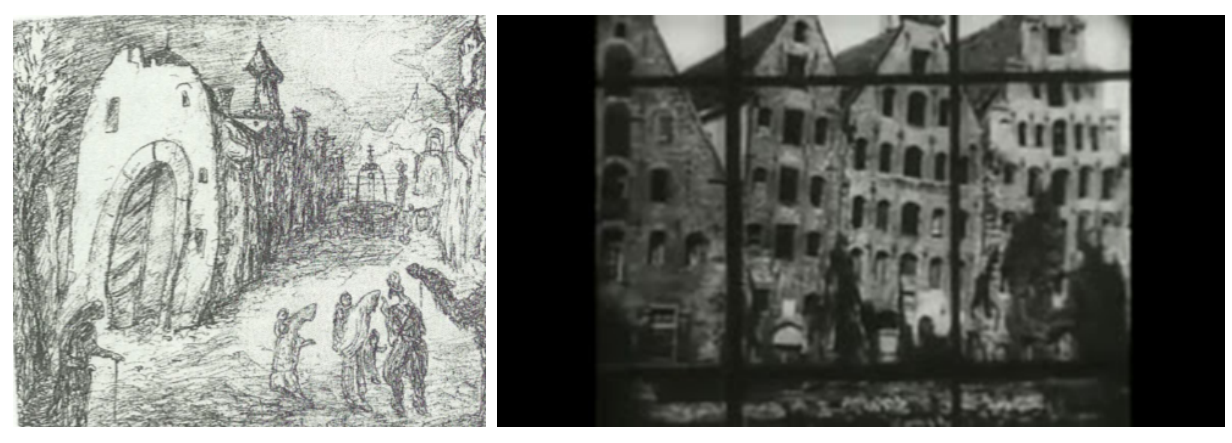
Fig. 5: Alfred Kubin's Albania (created before 1923) and a screen shot of Nosferatu's view in Bremen. Note the similar slant to the buildings.

The visual dimension of film offered to the expressionist a particularly fruitful means for subverting bourgeois codes of representation. The notion of objectivity and laws of reality defined by bourgeois standards could only limit imagination. Thus stylized architecture of the Caligari sets, the blurred distinctions between the real and metaphorical in Nosferatu ...manifest a refusal to acknowledge the hegemony of "normal" perspective. (379)