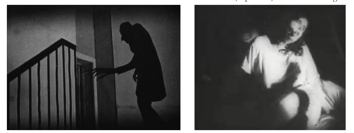
Fig. 3: The silhouette of Nosferatu moves towards his victim, but it is the shadow of The Count's hand that clutches her heart. Still images from Nosferatu (1922), the non-restored version, which is in the public domain.

In the climax, Count Orlok is living in Bremen across from Hutter and Nina. It is late and Hutter has fallen asleep on a chair. Nina, pacing, looks out the window – she sees Orlok watching her through a multi-paned window. Framing Orlok in such a way is symbolic; the panes appear to be bars representing the un-dead prison Nosferatu is trapped in for eternity. Though frightened, Nina sends Hutter to get help, setting her trap. Orlok makes his move. He ascends the stairs to Nina's bed, but he is seen in shadow only (Fig. 3). His features are elongated in shadow and, if possible, he is even more frightening.