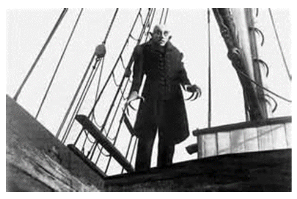
Fig. 4: Note how the angle of the camera enhances the dominance and fear factor of Murnau's vampire. Still image from Nosferatu (1922), the non-restored version, which is in the public domain.

the finely crafted stage-sets and lighting patterns which earned universal acclaim, but there were occasional links to real authority and actual monarchs, if not to social types prevalent in Weimar Germany" (Rubenstein 367). The audience may not have been aware of symbolism of the characters, but it is very likely their inclusion in the film had both expressionist and existential roots. For example, the image of the madman is also present in several Munch works in his "Murder Series" and in Alfred Kubin's The Alley (1905), where "a madman glides barefoot among cloaked passers-by, evoking more familiar figures of Munch" (Gosetti-Ferencei 49). In The Gay Science, Nietzsche's madman told a stunned crowd that God is dead by our hands. The lunatic tells us what we believe does not really exist; it has all been a lie, much like the empire that dissolved in 1918. Perhaps it is ironic that the political subtexts of films like Nosferatu were lost on viewers. They were like the audience listening to Nietzsche's mad man who laments that he has "come too soon" (Nietzsche 96). Both audiences, those in the darkened German theatre, and the one imagined by Nietzsche, simply do not see the reality that the madman is presenting them.